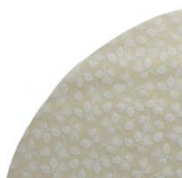
21 - AVORIO